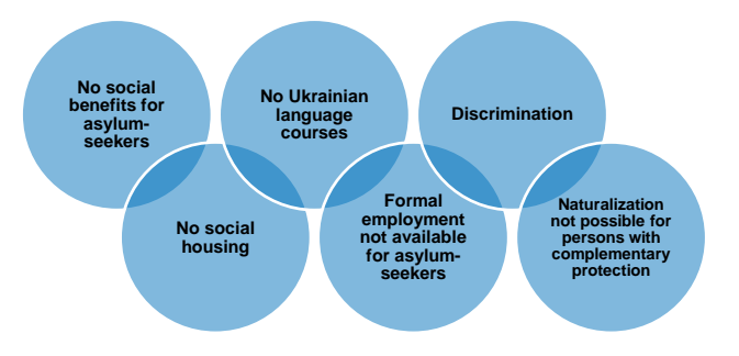
Key obstacles to local integration in Ukraine

access to apprenticeships or work-placement schemes; and advises on diploma recognition procedures to enable employment that matches refugees' and asylum-seekers' qualifications. UNHCR also assists with obtaining work permits and advocates with the State Employment Centre for inclusion of refugees and asylum-seekers in their retraining programs.